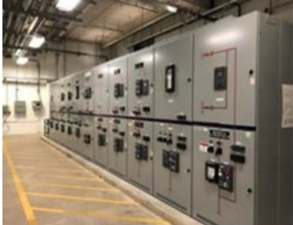
$60M PROJECT SUPPORT